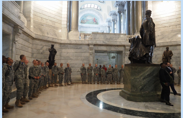
Our cadets participating in several activities!