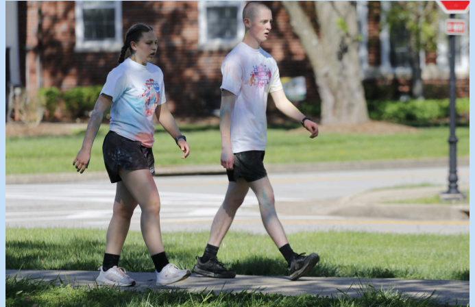
Our cadets participating in several activities!