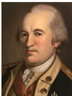
Major General Baron von Steuben

The Bluegrass Challenge Academy Blue Book takes its name from the “Regulations for the Order and Discipline of the Troops of the United States,” commonly called the “Blue Book.” Major General Baron von Steuben, America’s first Inspector General and Drill Instructor, wrote the Blue Book during the winter of 1778-1779. The Blue Book is based on the training plan he had devised while training the American Continental Army at Valley Forge. The Blue Book set down duties and responsibilities for corporals, sergeants, first sergeants, and sergeants major, effectively encompassing the NCO ranks of that day. The Blue Book also established the qualities a Soldier must have to serve in demanding positions. BCA honors that proud tradition by having its own Blue Book.